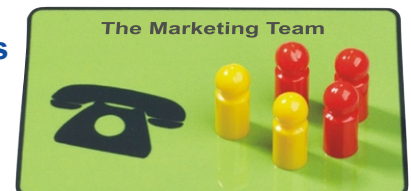
A pic of a small part of one of our games

The Business Experience incorporates your key course objectives and brings them to life.