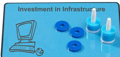
A pic of a small part of one of our games